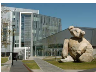
Atkinson Hall University of CA San Diego La Jolla Campus

Our scientific program will take place in Atkinson Hall, home of Calit2 at UCSD. This building is designed as an instrument of research to encourage partners to combine in unusual teams to make fundamental discoveries. As a result, one of its defining characteristics is a constant state of change. Every aspect of the building, designed by NBBJ and constructed by Gilbane, is inspired by this notion of change and exemplified through interconnected, ubiquitous, broadband wireless communication and the change that it enables. The building promotes the coexistence - indeed, the interaction - of opposites. The main mass is composed of a six-story office tower "backbone" resting on the foundation of a first floor in the shape of an "S." The soft exterior shape was chosen for its organic - constantly changing - appeal