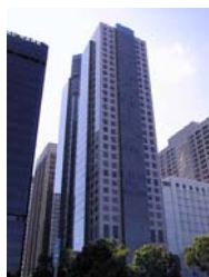
University Club 750 B Street San Diego, CA 92101

and inherently wireless-receptive nature. Large "propagation windows" rendered in clear glazing literally and figuratively allow transmission of line-of-sight communication signals and circulation patterns of people in the building.